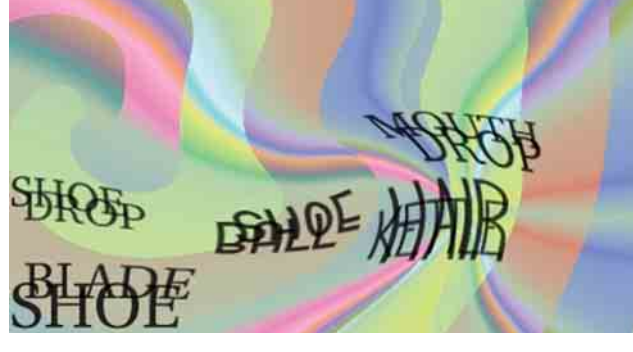
Figure 1. Can you read three words in this image?

In November 1999, for example, the Web site slashdot.com released an online poll asking which was the best graduate school in computer science a dangerous question to ask over the Web. As is the case with most online polls, IP addresses of voters were recorded in order to prevent single users from voting more than once. However, students at